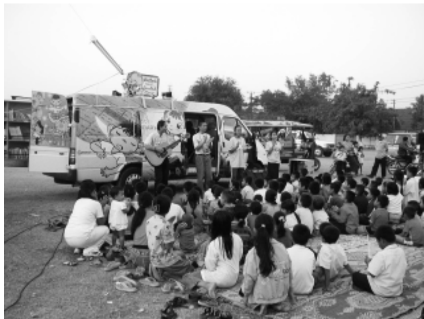
No. of Participants in Library Activities

In 2006, we will participate in the construction of Vientiane Municipal Library and multi-purpose hall (Ishida Memorial Hall) in a joint operation with JICHIRO and EFA Japan, as well as a Public Library for Vientiane province (a JICA grassroots project). We will also carry out the construction of model kindergarten attached to the Dongkhamxang teacher training school in co-operation with Ibaragi Asia Education Fund.