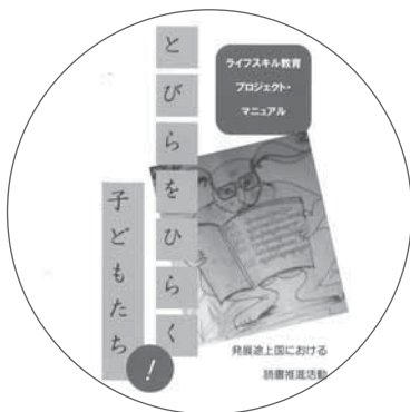
Life Skills Programs Manual, published by JNNE

SVA carried out various surveys and seminars on cooperation in cooperation with the Ministry of Foreign Affairs, Japan International Cooperation Agency (JICA), Graduate Research Institute for Policy Studies (GRIPS) and Ochanomizu University. SVA also served as the secretariat for Japan NGO Network for Education (JNNE), publishing a translation of the EFA Global Monitoring Report 2008 and cosponsoring the launching seminars with JICA and ACCU. JNNE also developed the Life Skills Education Program Manual with the contract from the Ministry of Education, Culture, Sports, Science and Technology. SVA and JNNE joined the 2008 G8 Summit Japan NGO Forum and made policy advocacy paper regarding basic education and child labor. In 2008, JNNE carried out the EFA Campaign "World's Biggest Lesson," which was participated by 25,000 school children in Japan.