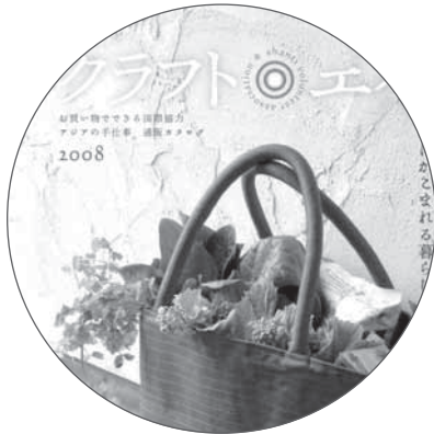
2008 Publications Catalog